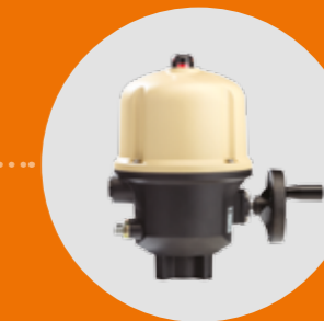
AQ5 - AQ10 - AQ15 - AQ25 - AQ30 - AQ50 SWITCH version