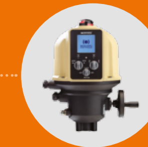
AQ5 - AQ10 - AQ15 - AQ25 - AQ30 - AQ50 LOGIC version