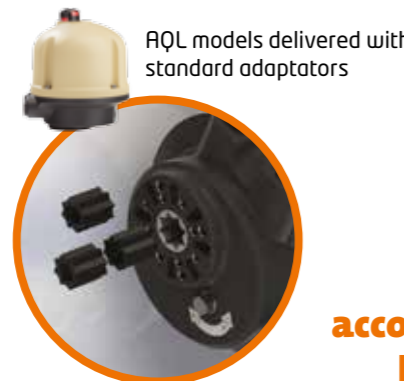
AQL models delivered with standard adaptors